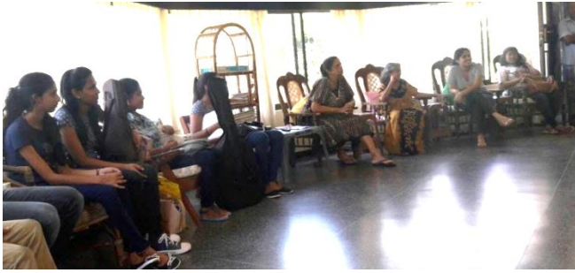
St Pauls Youth visit 2017